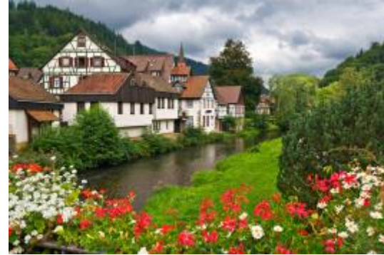
Saxon Switzerland National Park