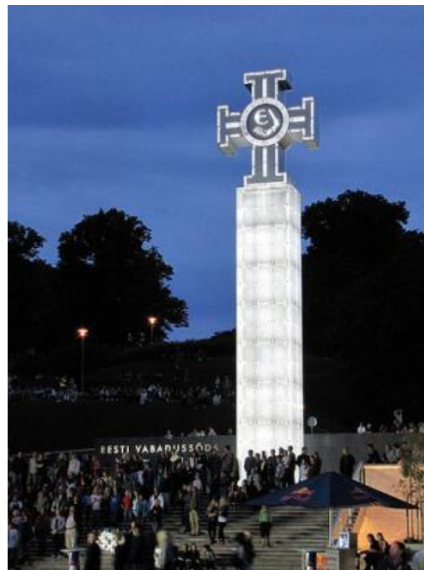
War of Independence Victory Column