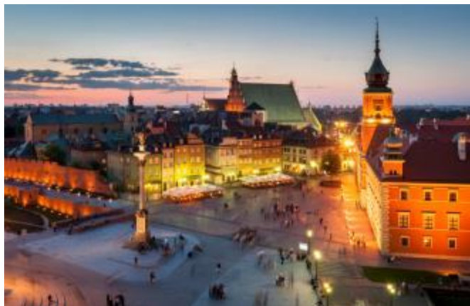
Warsaw Old Town