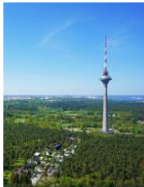
Tallinn TV Tower