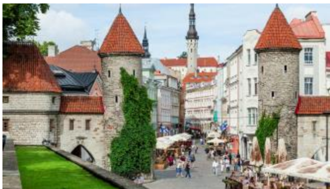
Tallinn Old Town